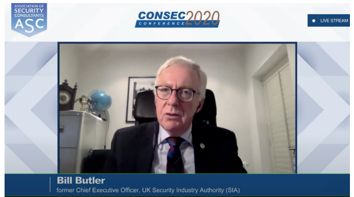
Main Stage - Live stream with bespoke graphic overlay

We were also on hand to provide technical support for all attendees and sponsors using the event platform to ensure everyone was able to access and engage in the event. Once the event finished we promptly provided the ASC & their sponsors with a large quantity of post-event data , showing attendee activity and engagement.