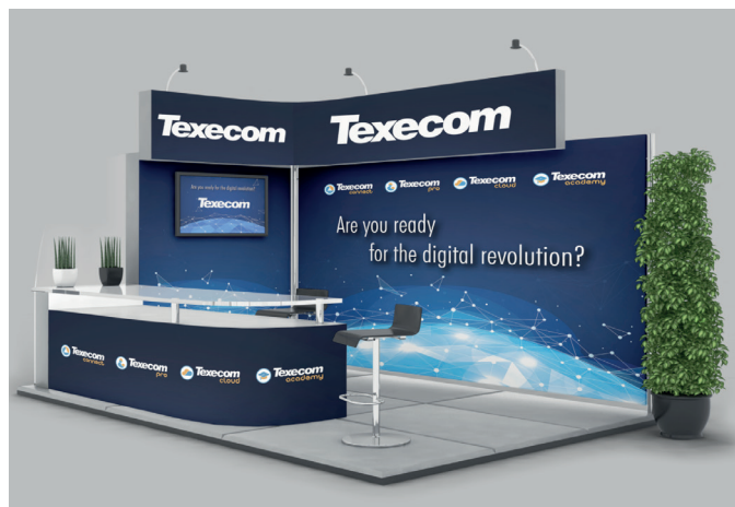
Evento Virtual - Example of Virtual Sponsor Booth

We liaised directly with the event sponsors to begin creating their exhibition booths with their custom graphics . The level to which we assisted with this process varied for the different sponsors, with some simply needing specifications for their graphics team to work with, and others wanting us to create their booths for them using branding elements from their website. In addition to this, we made an instructional video to brief the sponsors on how to operate their booth during the event.