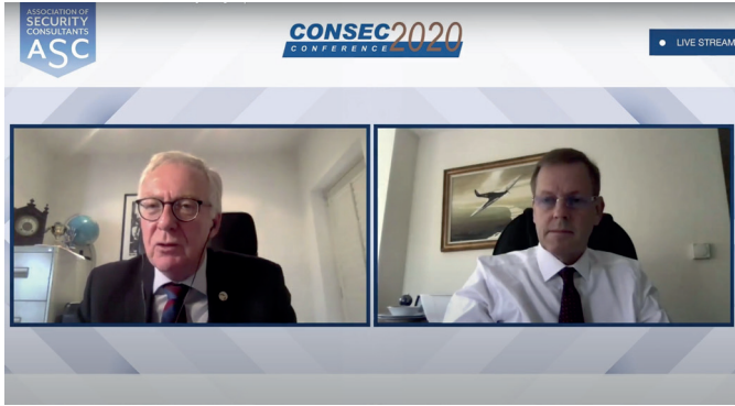
Main Stage - Live stream 2-up overlay

On the day of the event we ran a live production Zoom call for the speakers to give their presentations, which we combined in our studio with custom made graphic layouts to create a broadcast quality stream. Using our Epiphan Pearl video encoders, we can output a high quality stream to the event platform main stage for the attendees to view.