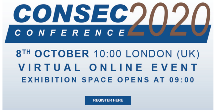
Bespoke landing page

In order to register attendees for the event we were asked to create a landing page to enable people to sign up for the event. This is essentially a basic web page with information about the event schedule and a registration portal . The ASC was able to access the registration database to see how many people had signed up and how their promotional content was affecting sign-ups. Everyone who signed up received a confirmation e-mail, and a reminder/access code the day before the event.